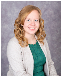
by Dusty Johnson Class 14

The mission of AGvocate is to be an advocate for agriculture.